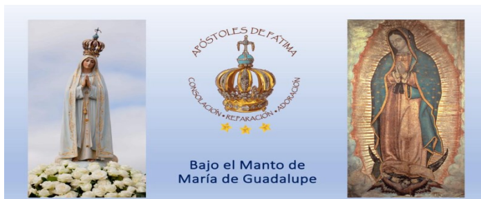
Bajo el Manto de María de Guadalupe

Rosario de reparación de los pecados cada 1er Sábado del mes a las 9:00 AM en la iglesia.